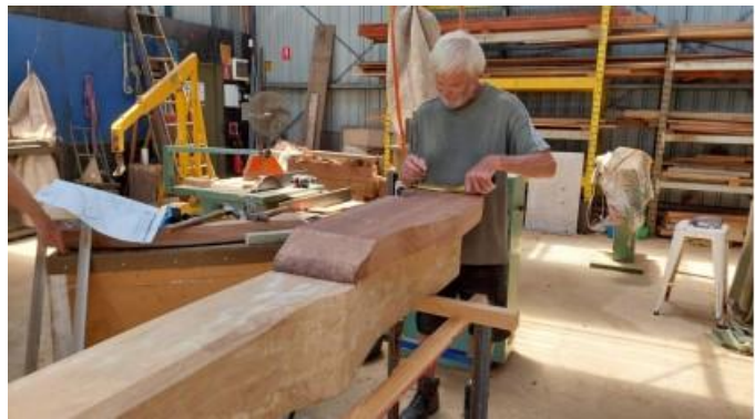
Shaping Cheek Plates to Trail.