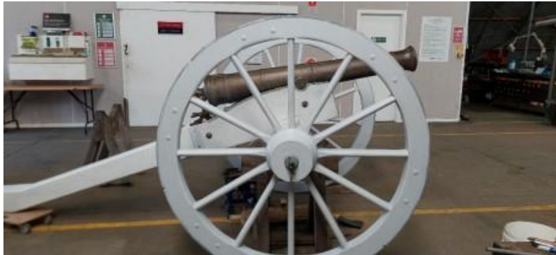
Barrel fitted to trunnion and wheels.