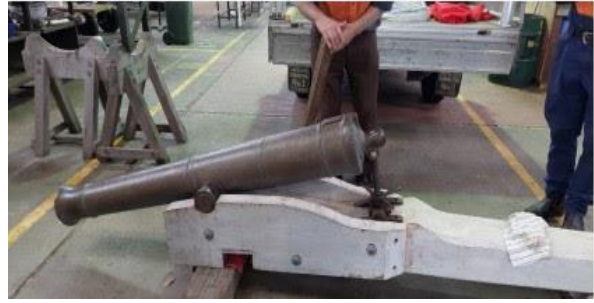
Fabricating the Cheek Brackets and Trunnion Caps. Insertion of Barrel and Elevating Mechanism into Trunnion Cups