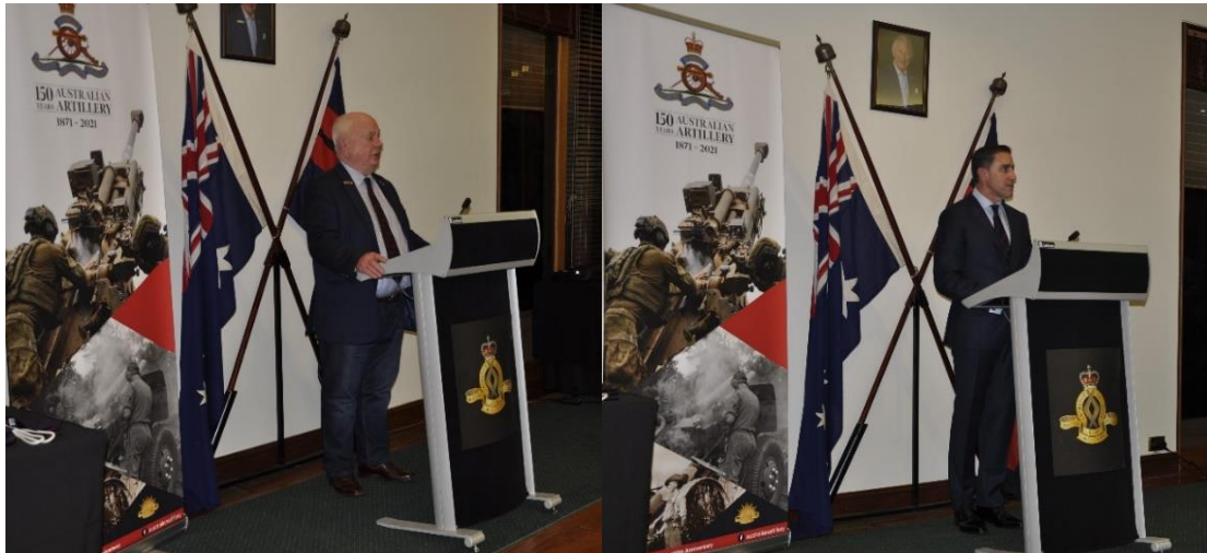
Chair RAAHC sets the event in motion