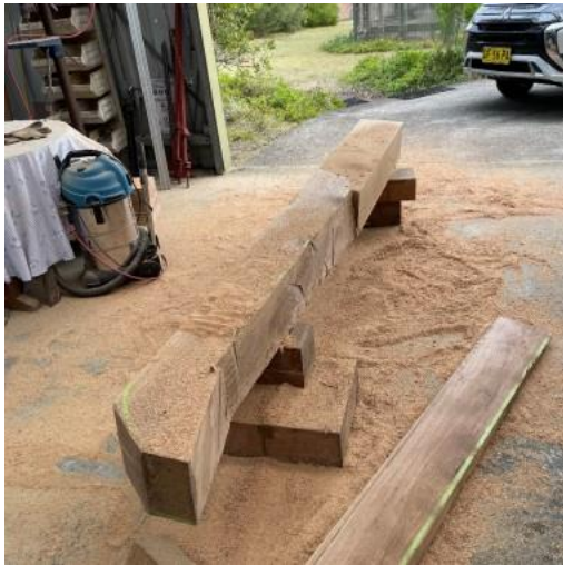
Rough out of trail by chain saw.

The barrel and elevating mechanism were delivered to the North Fort Restoration Centre in September 2023 initiating the work. All work is being carried out by Harbour Trust Volunteers, with the exception of the manufacture of the pair of wheels (by a wheelwright). The project is due to be completed in March 2025. The photos below show the work being done.