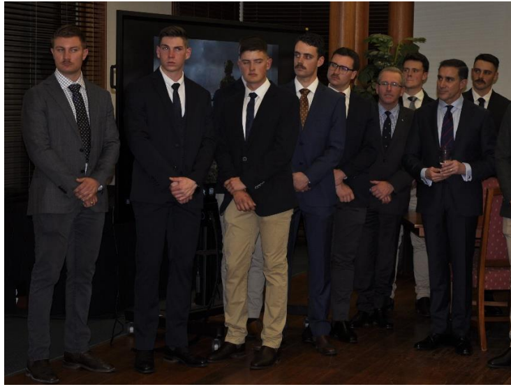
A group of the graduates with the Chief of Army (far Right)

The lanyards, ties and books set up in readiness. The trophy at the rear is the Urquhart Trophy which is awarded to the best RAA graduate.