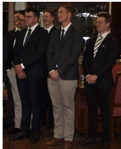
The remaining graduates